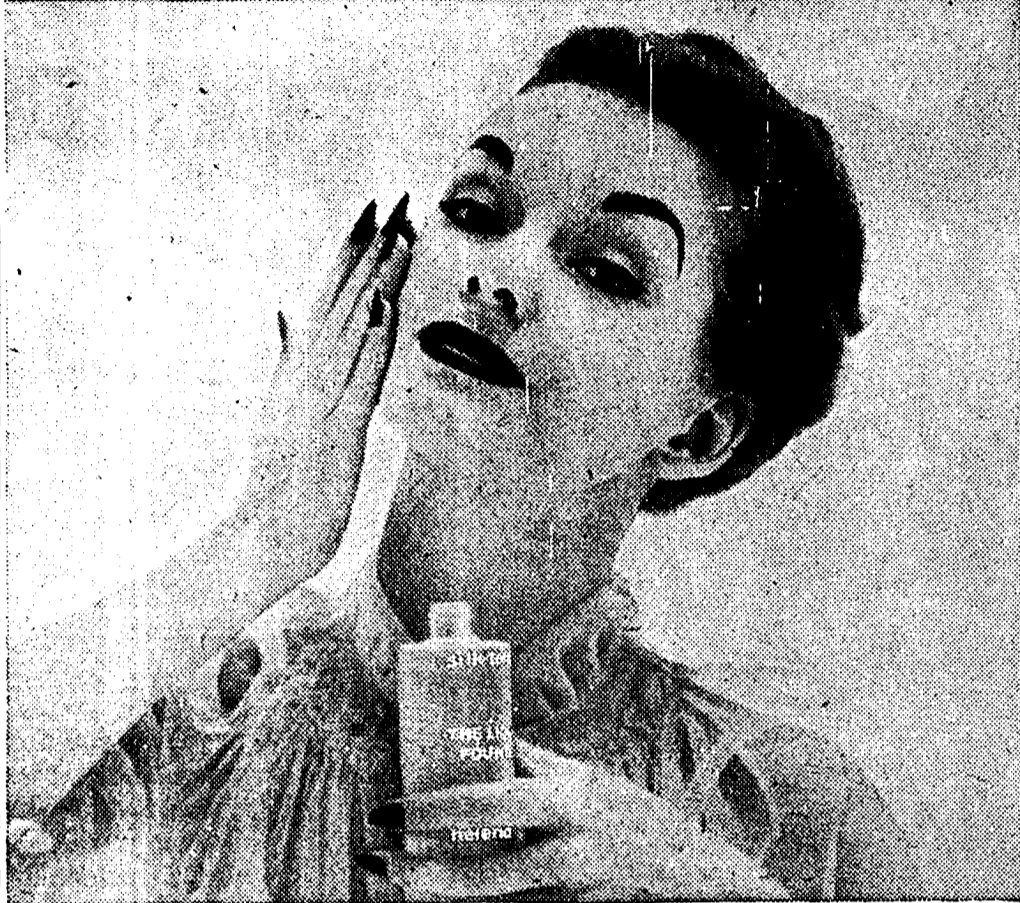
Helena Rubinstein's Silk-Tone Foundation is blended with pure atomized silk, to give dry skin dewy freshness and silken allure. It clings for hours without re-touching. And all the while, Silk-Tone acts like a beauty treatment... smoothing, softening and protecting complexions against winter weather.

The newest and most exciting way to wear your hair is—glided! It's the new jewelled look for hair, and there are several ways to do it—with a daring golden forelock... with light feathered touches all over for shot-with-gilt glamour. Either way, you can do it to a beautiful turn with Helena Rubinstein's GOLD TOUCH. GOLD TOUCH is liquid "gold"—you paint it on as easily as you do lipstick. The effect is ravishing—perfect for a dramatic entrance, cocktails at five or whenever you want to impress a man. Also in SILVER, 1.50 plus tax.